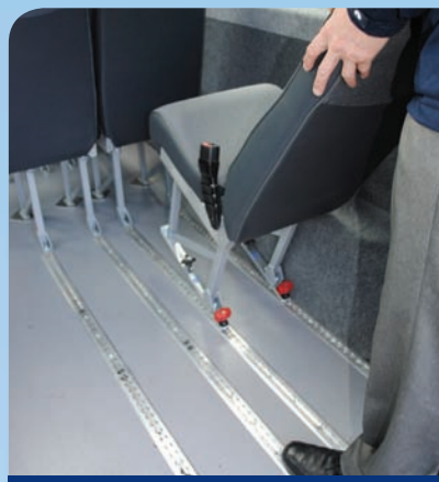
Lightweight seats are easily removed