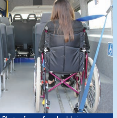
Plenty of space for wheelchair passengers

MINIBUS LITE is available in a choice of 3 wheelchair accessible versions, each with 17 seats. Access to the vehicle is by a full-width ramp or an electric lift which will take the wheelchair passenger into the rear of the vehicle. Four point restraints and a 3 point seat belt keep the wheelchair passenger safe and secure. MINIBUS LITE wheelchair accessible versions can take up to 4 wheelchair passengers. GM Coachwork offer a wide range of mobility adaptations so we can tailor your MINIBUS LITE exactly to your requirements.