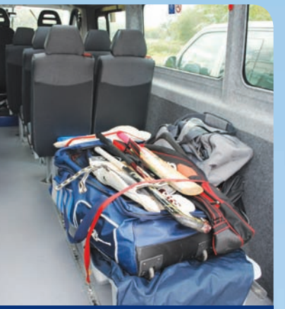
Useful luggage and kit space